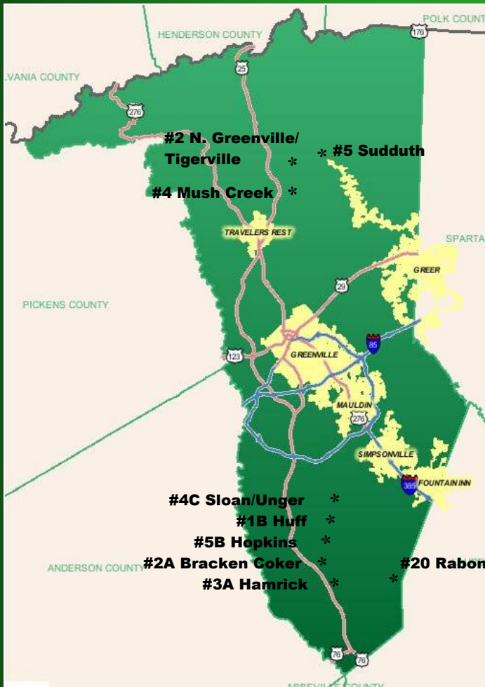
Watershed Lakes Greenville County, SC

Last year, the District hired a company to dive the lakes and make a report on outlet structure conditions. From this report, a plan of work was created. The contract to cycle the gates and/or replace the deteriorated hardware was awarded to McCall Brothers. McCall Brothers is currently more than halfway finished with the work and the District is pleased to be able to assure the integrity of the gates and structures for years to come.