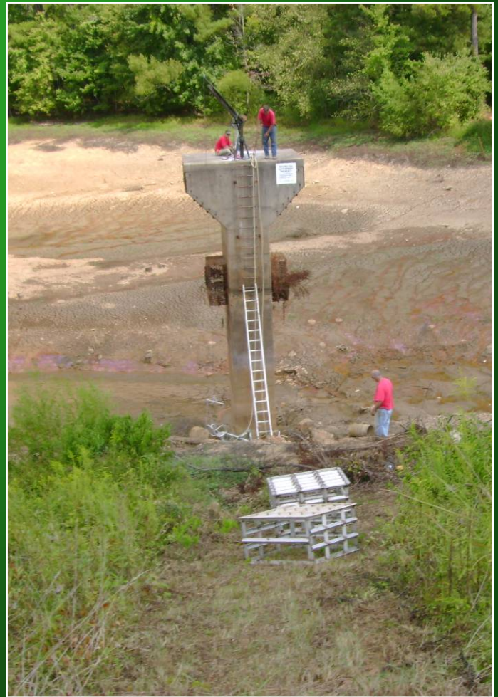
McCall Brothers replacing rusted trash racks with newly fabricated ones.