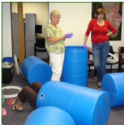
Assembly required flexibility!