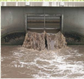
ReWa Water Treatment Plant

GCSWCD appreciates the participation of ReWa, Conestee Foundation, May-lan Tree Farm, and all of the fantastic teachers who made this year’s summer teacher training successful!