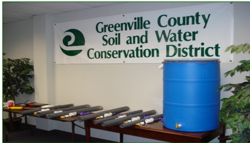
Participants in GCSWCD's first Build-a-Rain Barrel workshop were provided with supplies and technical assistance to build their own rain barrel.