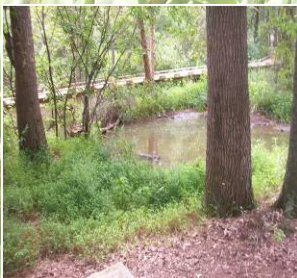
Lake Conestee Nature Park