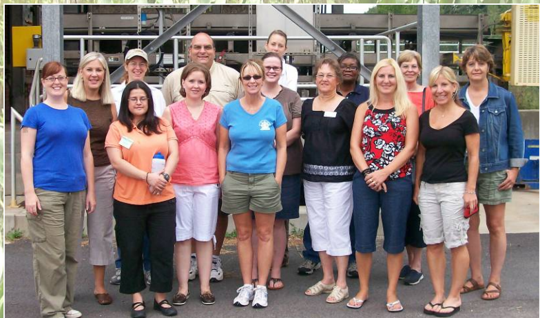
Teachers, GCSWCD Commissioners & Staff on a field trip tour of the County