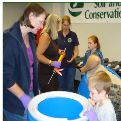
Even the youngest participated in assembling the 9 rain barrels