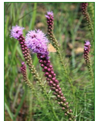
Liatris blooming in the Rain Garden.

Thank you to all Rain Garden contributors and sponsors: