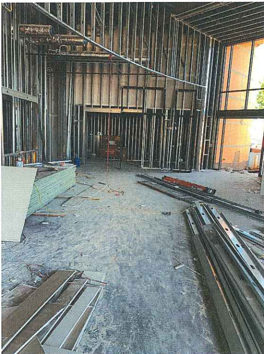
Lobby and entrance to the 2 nd Stage Theatre.