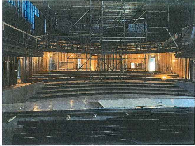
Audience chamber in the MainStage Theatre.