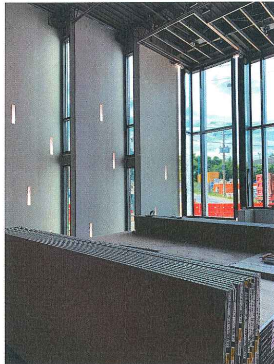
Donor wall in the lobby.