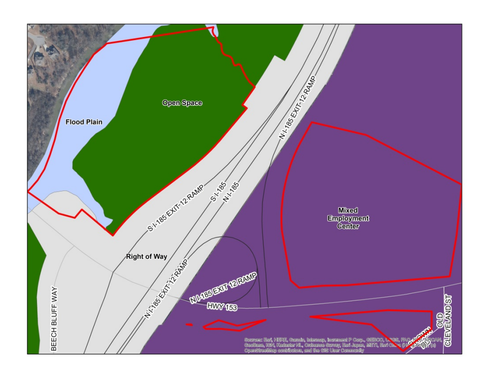
Plan Greenville County, Future Land Use Map