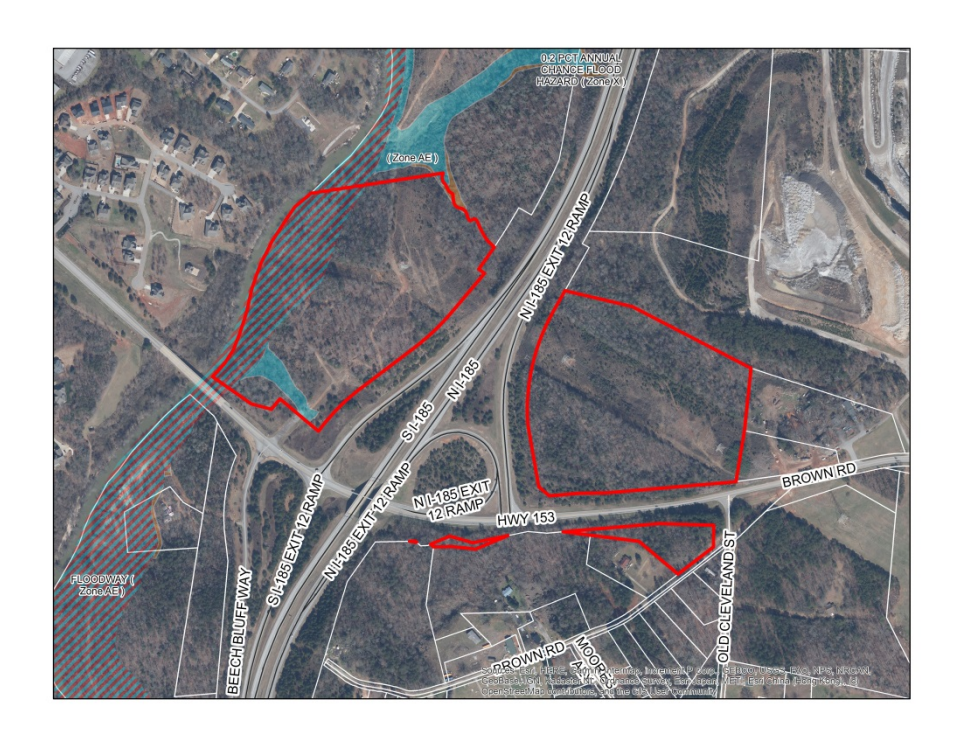
Aerial Photography, 2020