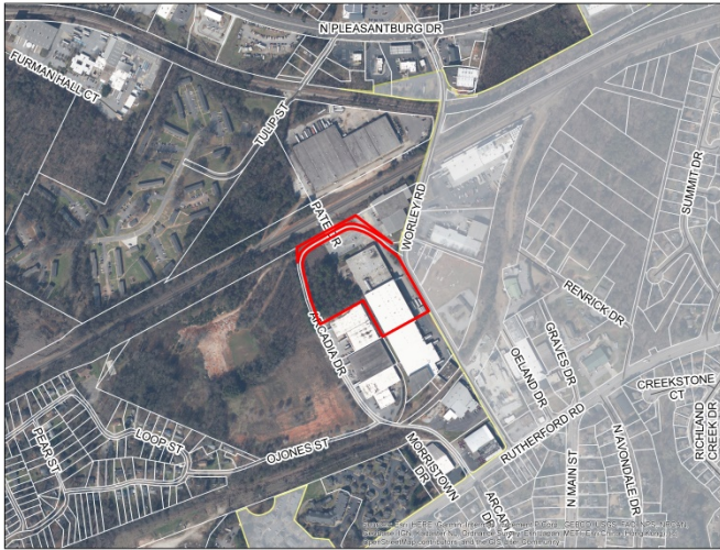
Aerial Photography, 2020