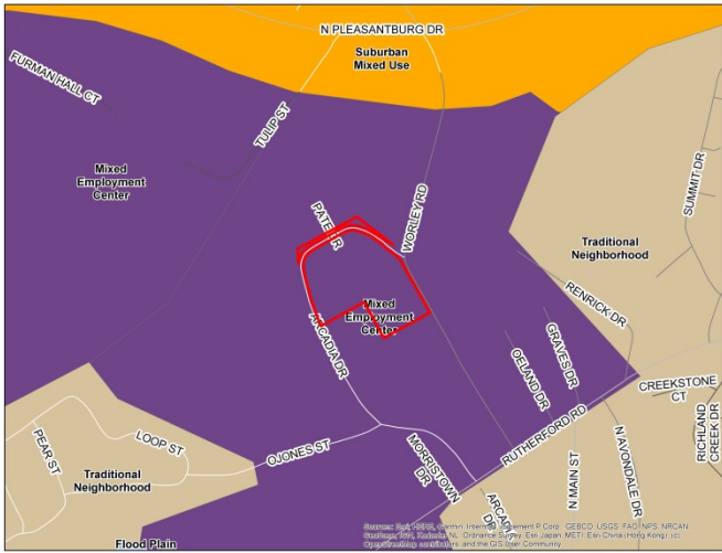
Plan Greenville County, Future Land Use Map