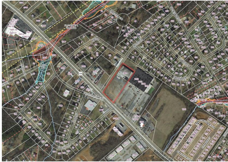
Aerial Photography, 2021