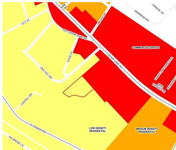
Berea Community Plan, Future Land Use Map