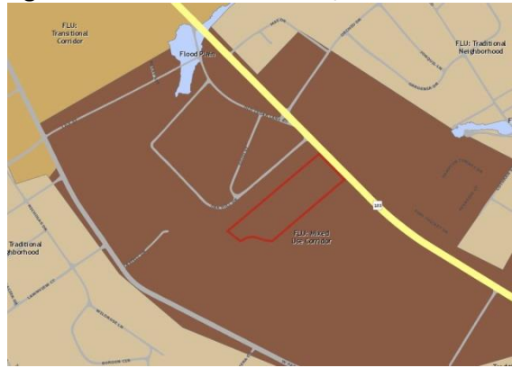
Plan Greenville County, Future Land Use Map