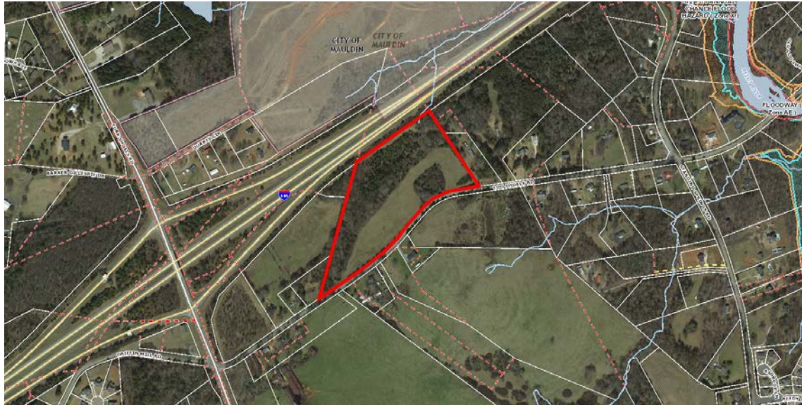
Aerial Photography, 2021