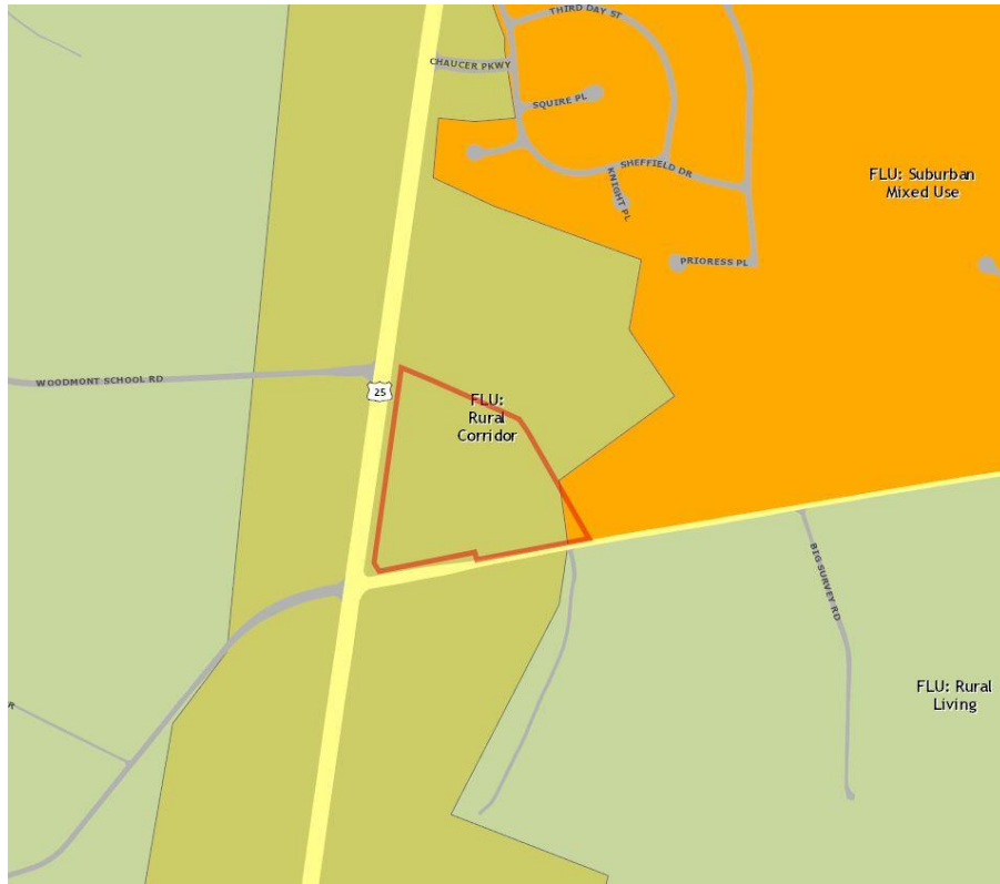
Plan Greenville County, Future Land Use Map