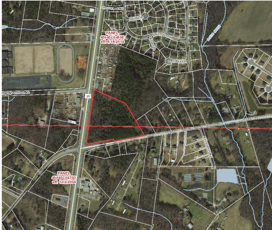
Aerial Photography, 2021