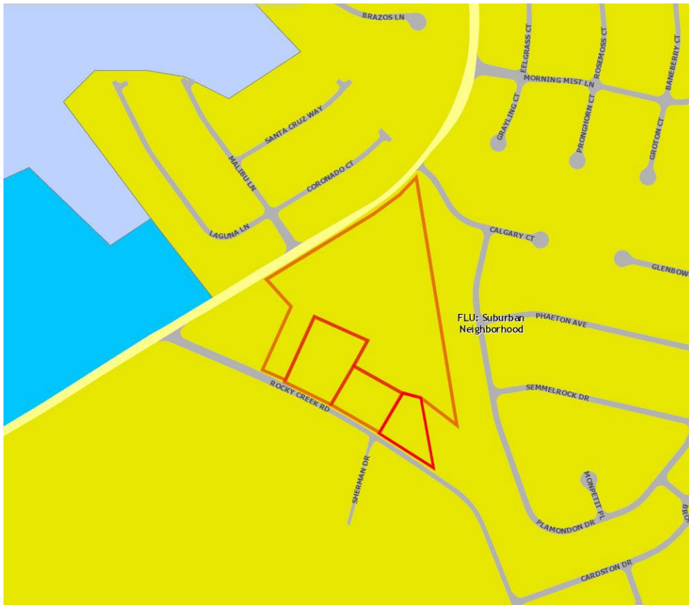
Plan Greenville County, Future Land Use Map