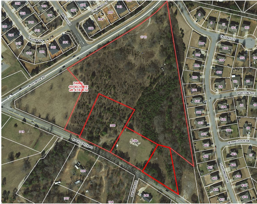
Aerial Photography, 2022