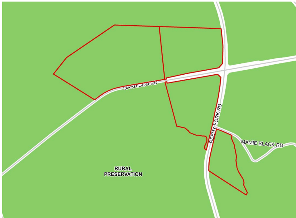
South Greenville Area Plan, Future Land Use Map