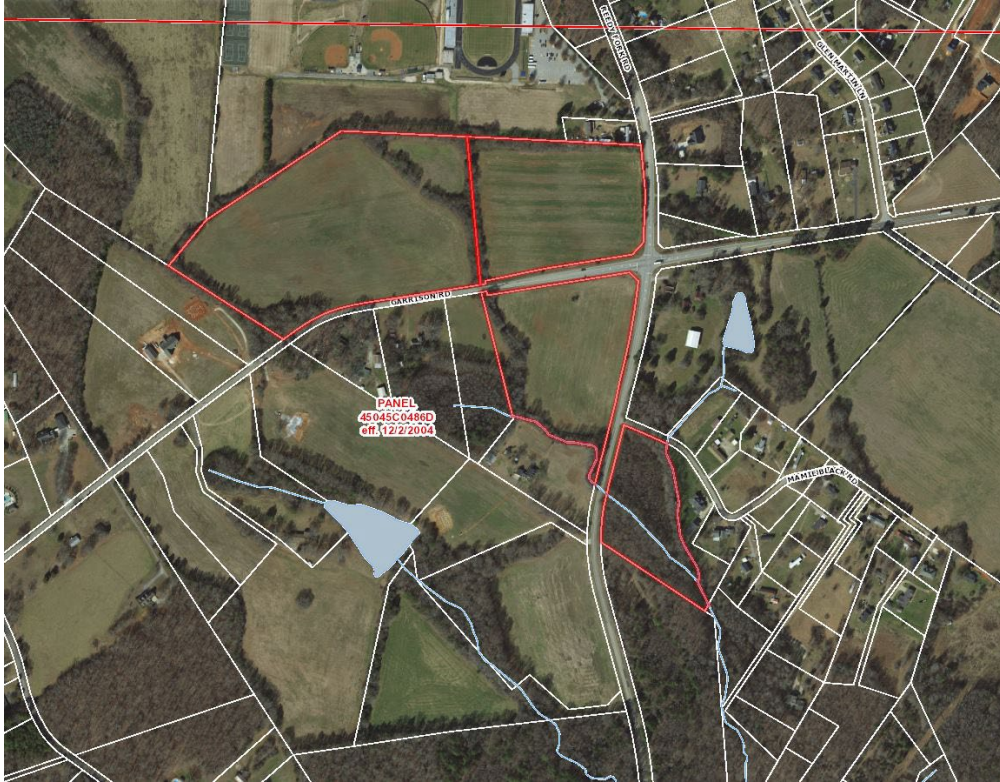
Aerial Photography, 2021