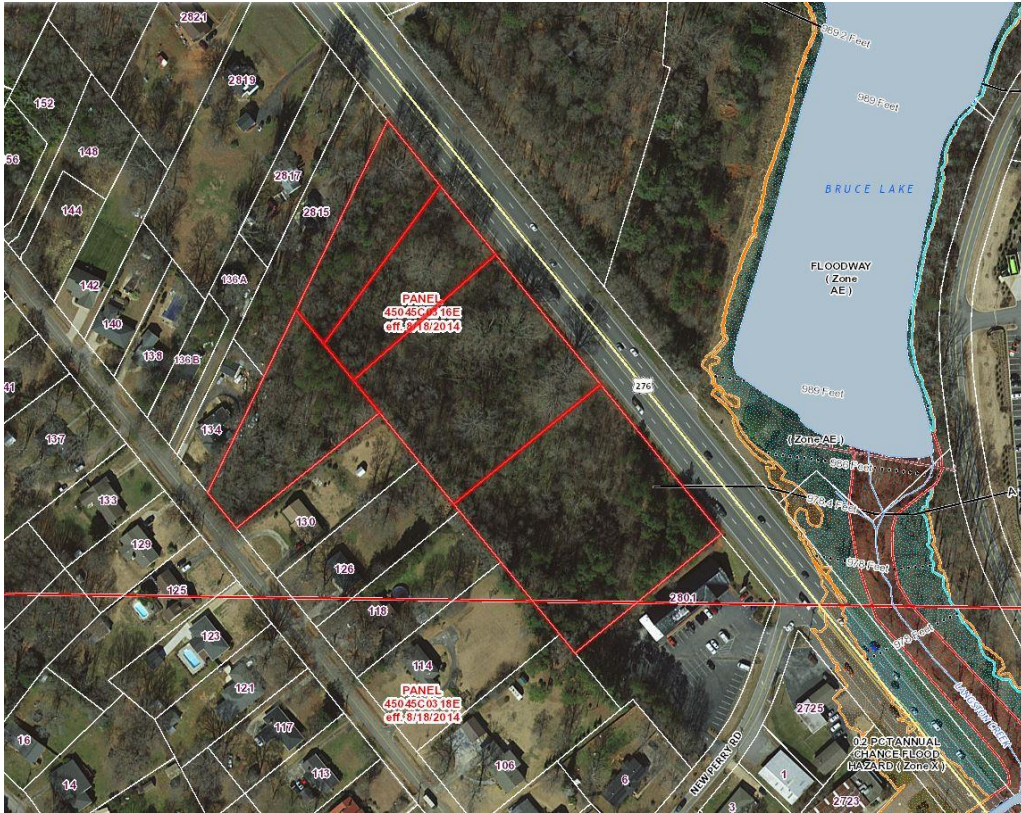
Aerial Photography, 2022