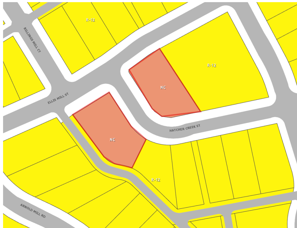
Zoning Map, Zoomed In