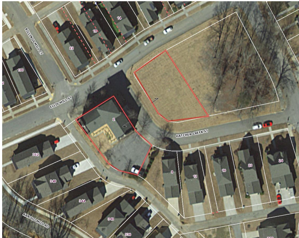
Aerial Photography, 2022