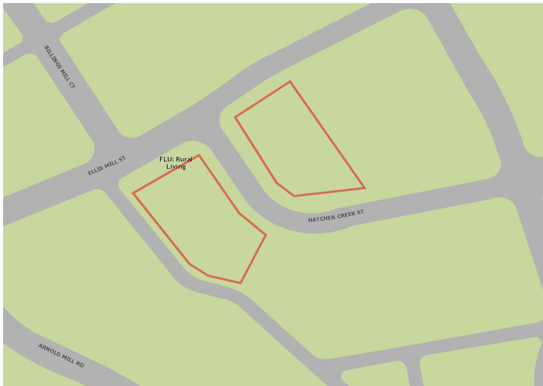
Plan Greenville County, Future Land Use Map