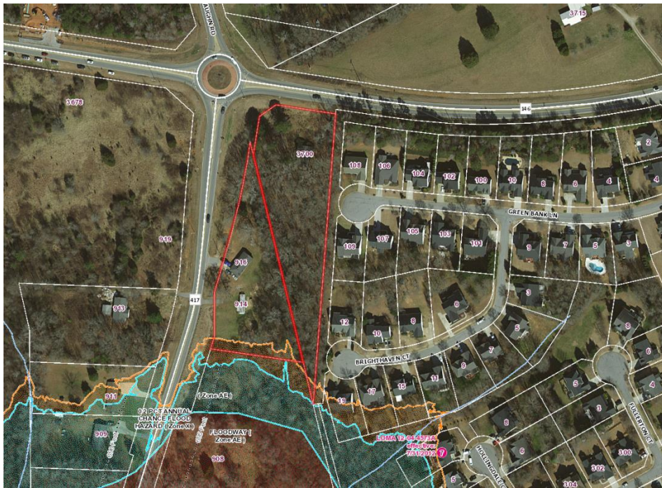
Aerial Photography, 2022