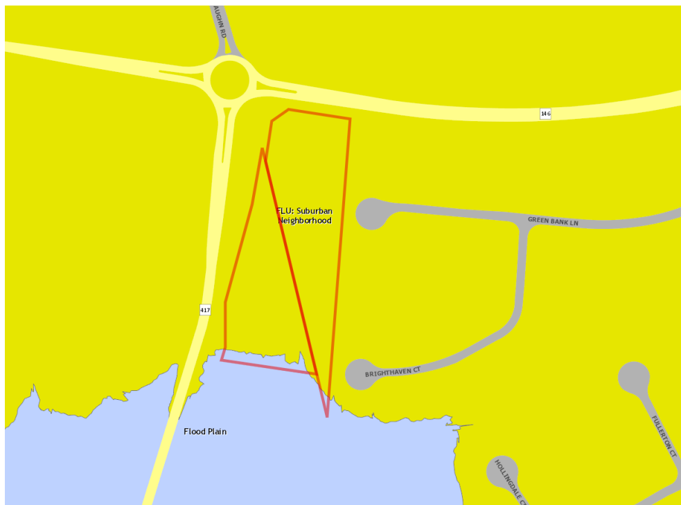
Plan Greenville County, Future Land Use Map