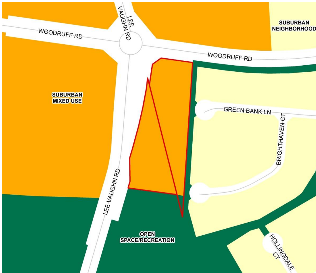
Five Forks Community Plan, Future Land Use Map