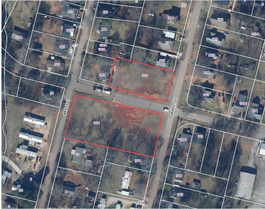
Aerial Photography, 2023