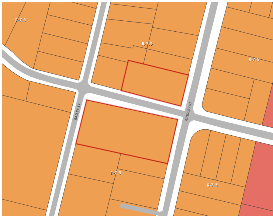
Zoning Map, Zoomed In