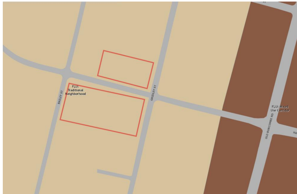
Plan Greenville County, Future Land Use Map