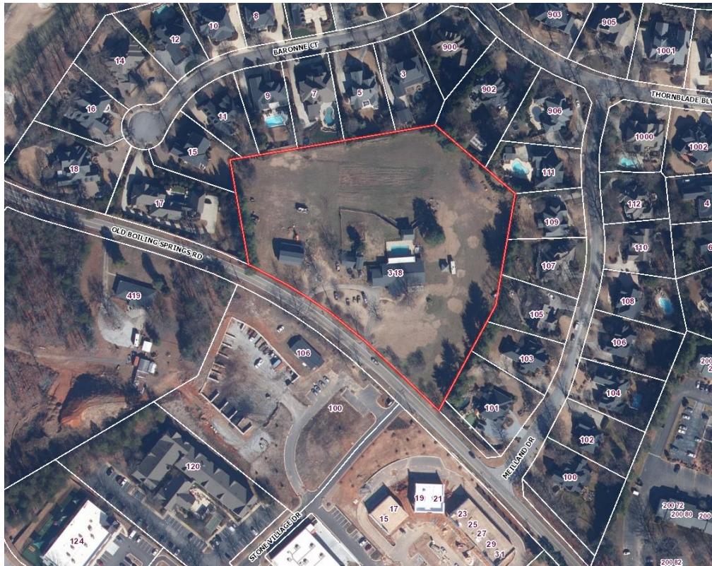
Aerial Photography, 2023