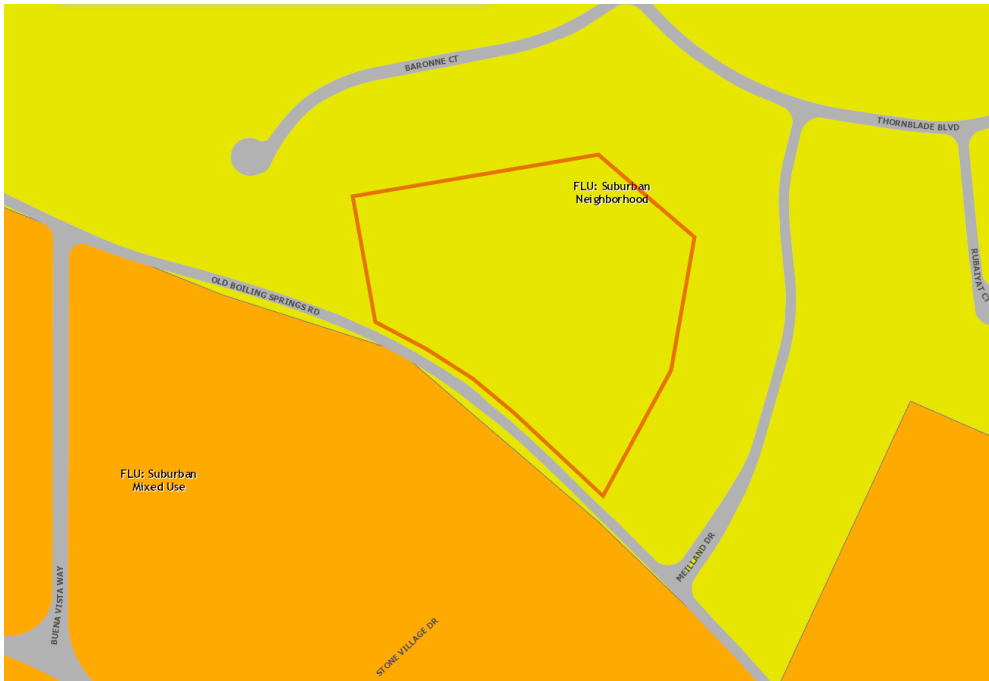
Plan Greenville County, Future Land Use Map