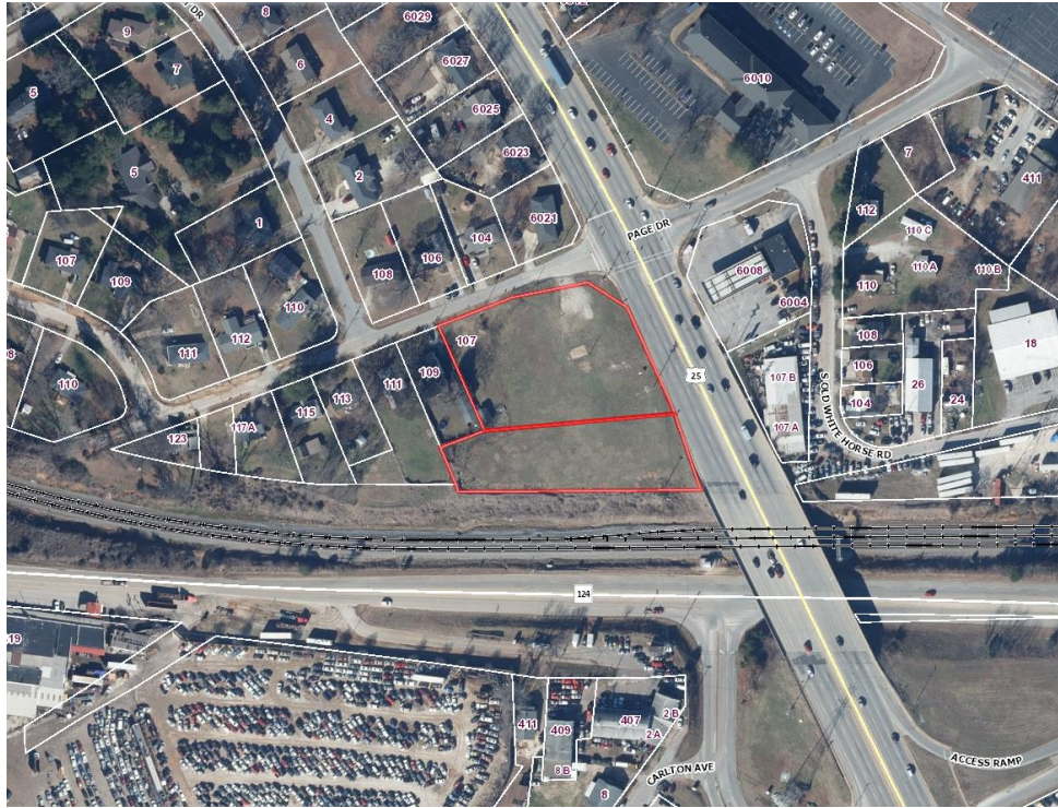
Aerial Photography, 2023