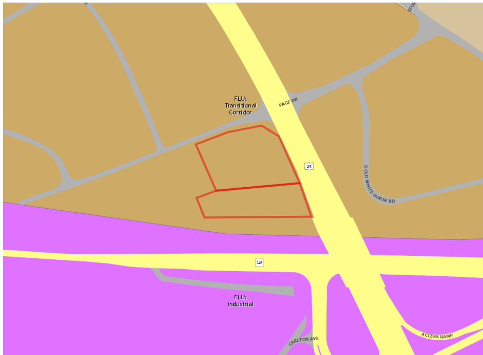
Plan Greenville County, Future Land Use Map