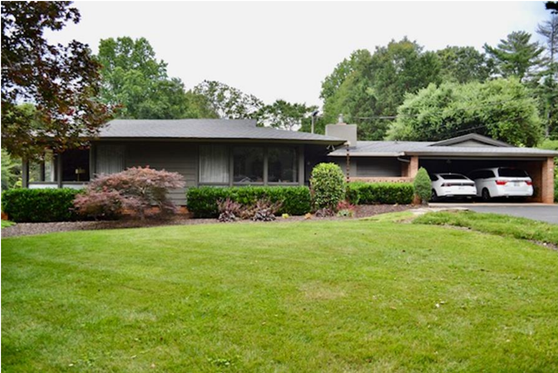
Views from East: