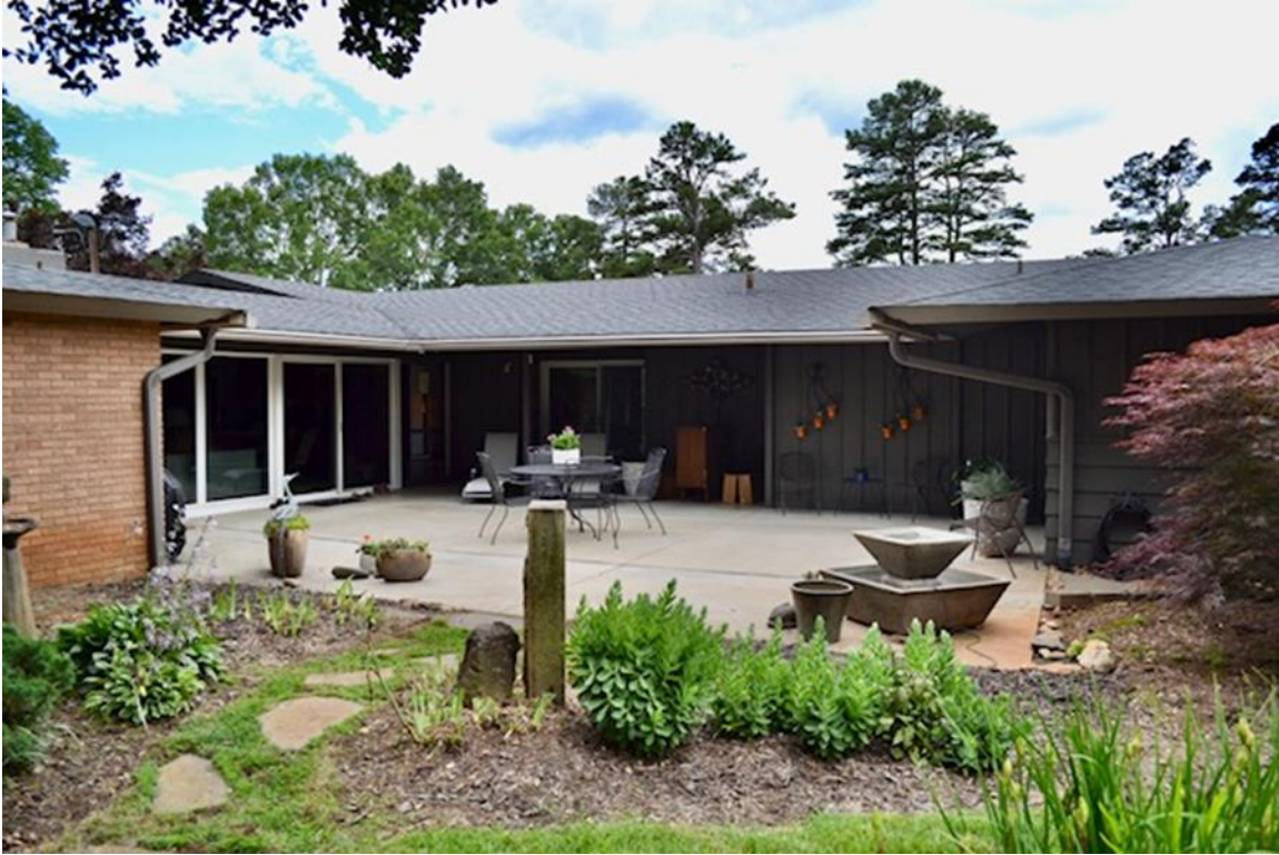
View from North: