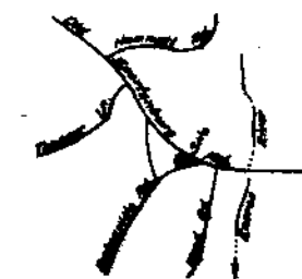
LOCATION MAP M.T.S.