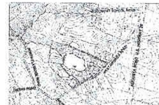
LOCATION MAP 1"=1000'