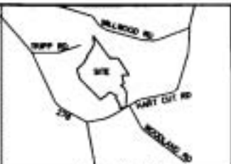
LOCATION MAP (N.T.S.)

GENERAL NOTES: 1. THIS PLAN IS TO BE CONSIDERED AS A PRELIMINARY PLAN AND IS NOT TO BE USED FOR CONSTRUCTION. 2. THE PROPERTY LINES SHOWN ON THIS PLAN ARE BASED ON A SURVEY MADE BY THE ENGINEER AND ARE SUBJECT TO CORRECTION. 3. THE ENGINEER HAS NOT BEEN ADVISED OF ANY CHANGES TO THE PROPERTY LINES SINCE THE SURVEY WAS MADE. 4. THE ENGINEER HAS NOT BEEN ADVISED OF ANY CHANGES TO THE PROPERTY LINES SINCE THE SURVEY WAS MADE. 5. THE ENGINEER HAS NOT BEEN ADVISED OF ANY CHANGES TO THE PROPERTY LINES SINCE THE SURVEY WAS MADE. LEGEND: 1. AREA OF A LOT WHICH IS NOT TO BE SUBDIVIDED 2. AREA OF A LOT WHICH IS TO BE SUBDIVIDED